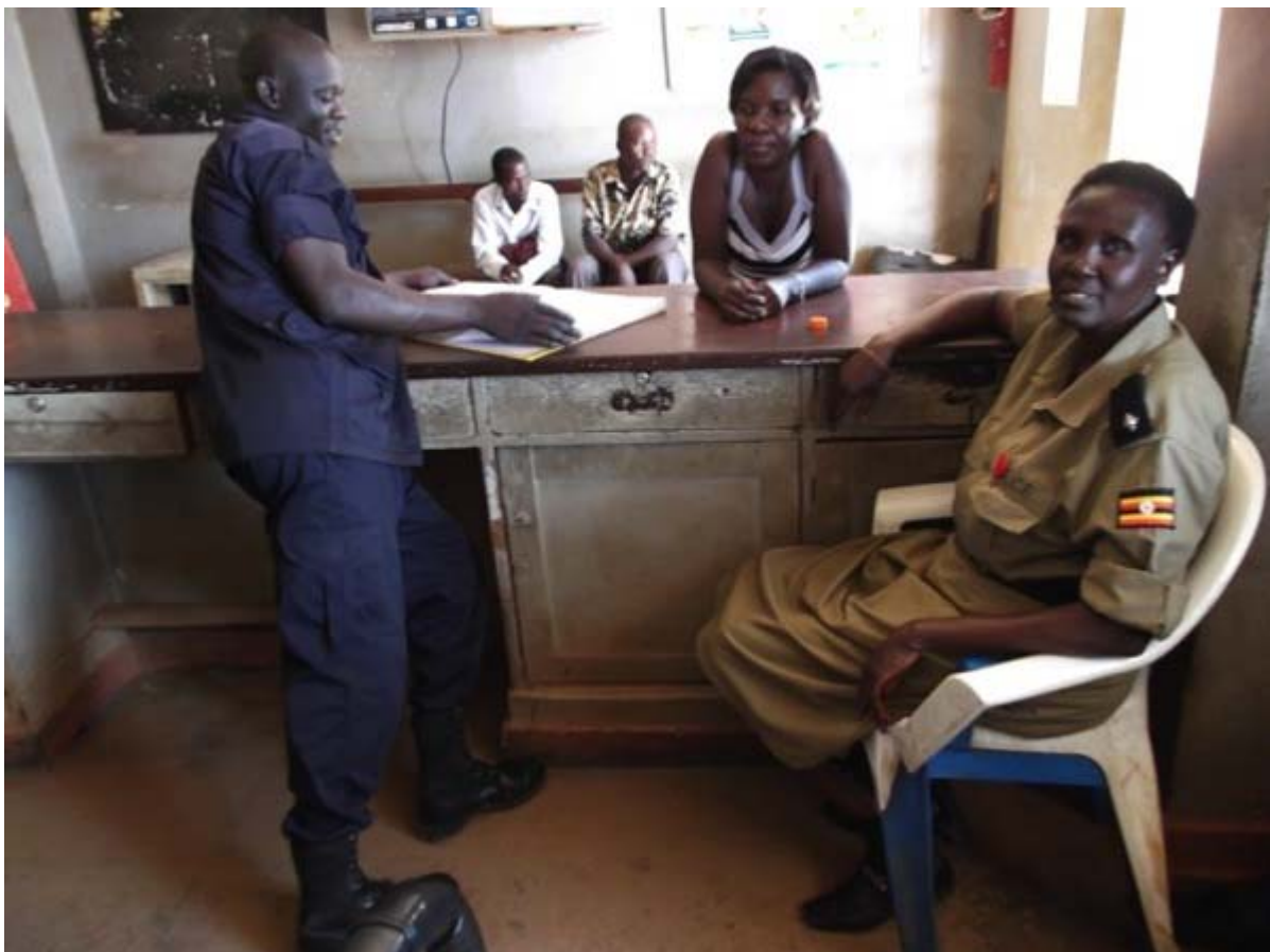
24: The desk in an Ugandan police station, seen from the officers' side.

The state-society-relation which we observed comprises a broad range of attitudes, reaching from severity and strict rule application to lenience, corruptibility, and even pity and mercy on the police's side, and from obedience to bribing, ignorance, and resistance on the side of the citizens. The logic of social life affects what the police actually are and do. It also affects their efforts to maintain order, as in our example of the order of the station. Surprisingly, this order is more flexible and permeable than one might assume. Although some officers are not satisfied with the presence of nightly visitors, they accept them. What is more remarkable, the civilians select the station themselves. Due to lack of alternatives and knowing about danger at nights, they choose the station as being a safe place. This is even more surprising since, as we will see in the example of patrolling streets, it is also this societal group of street children and homeless people that police suspect to be responsible for disorder and crimes. Thus, they are target groups for arrests and sometimes even violence and brutality. Instead of avoiding any contact with the force, however, they themselves decide to go to the police for very personal reasons and make use of the police properties in their own way.